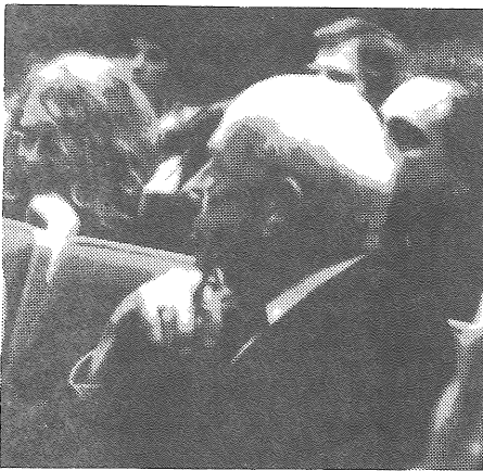
Willard Van Orman Quine

Many philosophy departments complain of their lack of a stimulating speaker series. Our problem has been just the opposite. During the academic year we often have two or three talks in a single week-- so many that it is impossible for anyone to take them all in. Most talks are therefore attended by the relatively small group of faculty and students who are particularly interested in the topic at hand. In a sense,