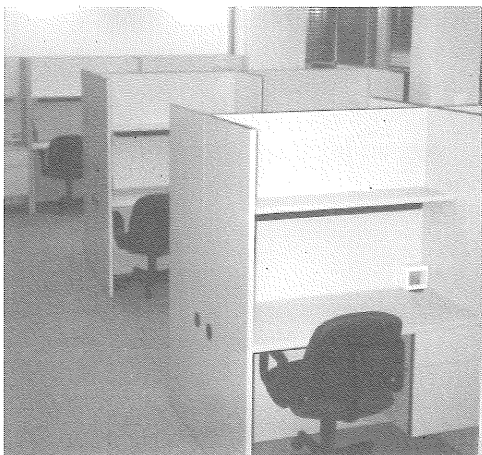
Graduate Study Room

What has emerged from the renovation process is a department whose physical space has been reshaped in a number of important ways.