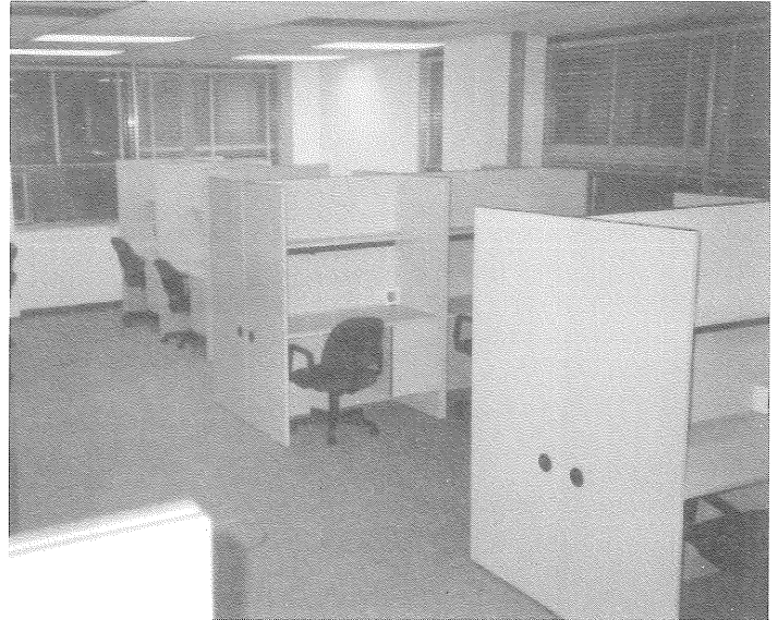
Graduate Study Room: another view

In seven years, at the end of the millennium, the Department will celebrate its 150th anniversary. From humble beginnings, we have come a long way. And we are not finished yet.