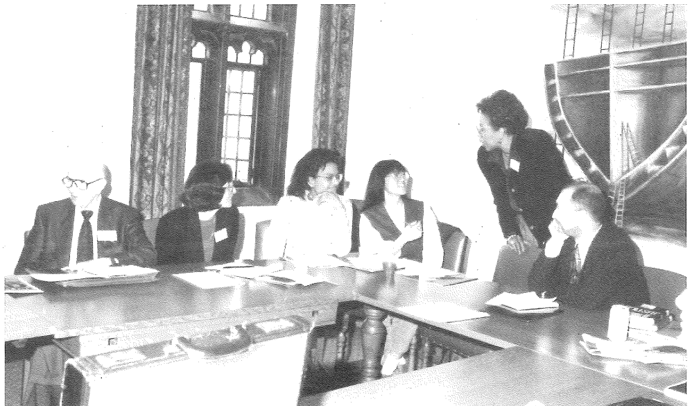
Participants at one of the roundtables