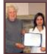
Gombay & Basu